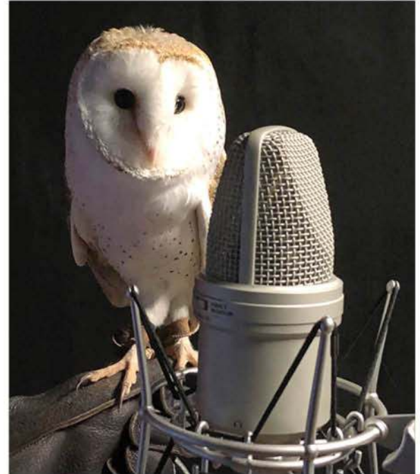
Animal Ambassador Sonic the Barn Owl visits the recording studio for a guest appearance.